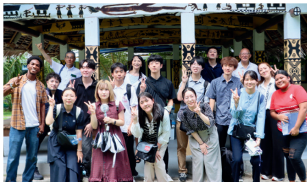
HIROSAKI UNIVERSITY DELEGATION VISITS PCC CAMPUS FOLLOWING THEIR INITIAL VISIT IN FEBRUARY 2025