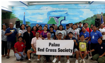
A GROUP PHOTO OF PCC STAFF AND STUDENTS WHO ATTENDED THE PALAU RED CROSS SOCIETY (PRCS) NOONTIME SEMINAR.