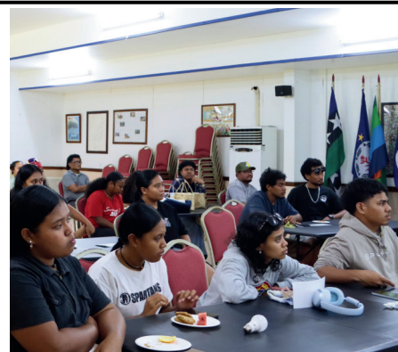
STUDENTS ATTENDING THE NOONTIME SEMINAR SESSIONS

Applications for the scholarships can be obtained both in person at the PCC Development Office and online at tinyurl.com/mesekiuscholarships . All documents must be submitted to