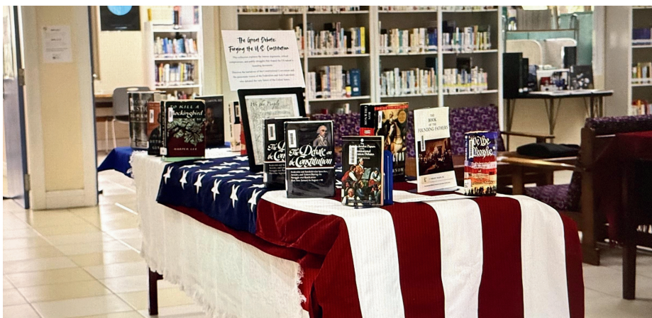
FREEDOM TO READ: A CONSTITUTION DAY DISPLAY AN EXHIBITION SHOWCASING CHALLENGED AND BANNED BOOKS

The Tan Siu Lin Library at Palau Community College (PCC) commemorated U.S. Constitution Day with special displays from September 17 to 19, 2025. This observance underscored the enduring significance of the Constitution and its influence on civic life, while also drawing parallels to Palau's own constitutional heritage.