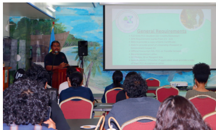
DEVELOPMENT OFFICE STAFF PRESENTING ALL SCHOLARSHIP OFFERED AT PCC

On September 18, 2025, the Development Office, in partnership with the Continuing Education office, conducted a noontime seminar focused on PCC-based scholarship opportunities. Although the seminar experienced a brief delay due to a power outage, the Development Office staff quickly adapted to the situation, ensuring that students could still participate and receive the information as intended.