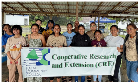
PCC COOPERATIVE RESEARCH AND EXTENSION STAFF AND STUDENTS AT KOROR STATE CULTURAL YOUTH FORUM

On September 11-12, 2025, PCC-Cooperative Research & Extension (CRE) participated in the Koror State Cultural Youth Forum, connecting young people with Palau's heritage through hands-on learning.