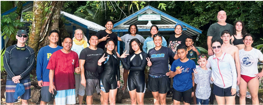
FSA MEMBERS WHICH CONSISTS OF PCC ASSOCIATE PROFESSORS AND INSTRUCTORS ALONG WITH FAMILY AND FRIENDS