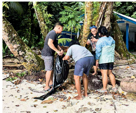
FSA MEMBERS PARTICIPATING IN THE BEACH CLEANUP

The retreat concluded with renewed energy for the next semester ahead, serving as a reminder that leadership involves both high-level planning and hands-on service.