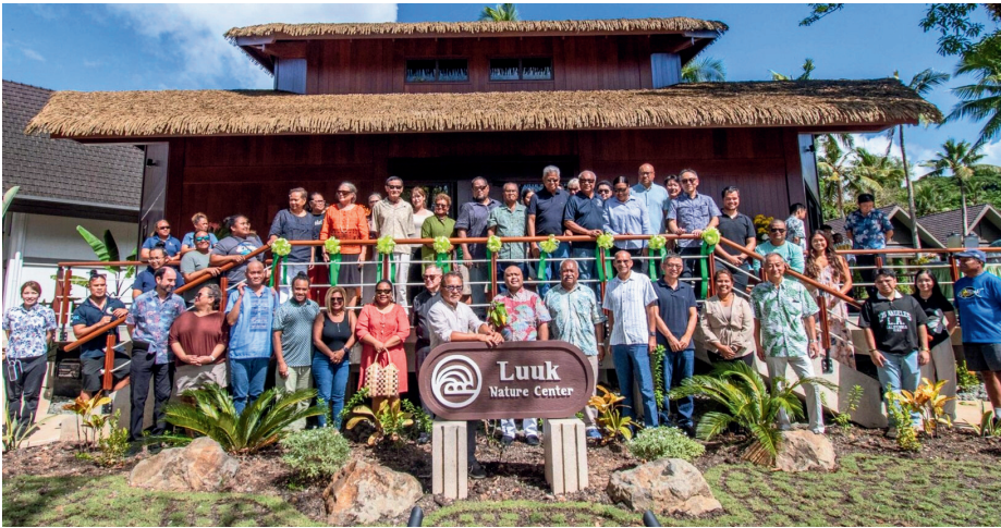
CELEBRATING THE GRAND OPENING OF THE LUUK NATURE CENTER WITH A MEMORABLE GROUP PHOTO

On Friday, December 12, 2025, President Dr. Tellei attended the Grand Opening of the much-anticipated Luuk Nature Center, underscoring the importance of environmental conservation and sustainable tourism in Palau. The event took place at Palau Pacific Resort's very own Nature Center, a new initiative designed to promote education, awareness, and appreciation of the nation's unique natural heritage.