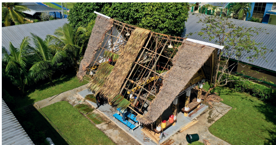
LAST WEEK'S AERIAL VIEW: RENOVATING BY REMOVING OLD THATCHES AND REPLACING THEM

As the work progresses, the Mesekiu Bai will be ready ahead of Spring 2026 to welcome visitors and continue serving as a space for gathering, learning, and celebrating Palauan culture.