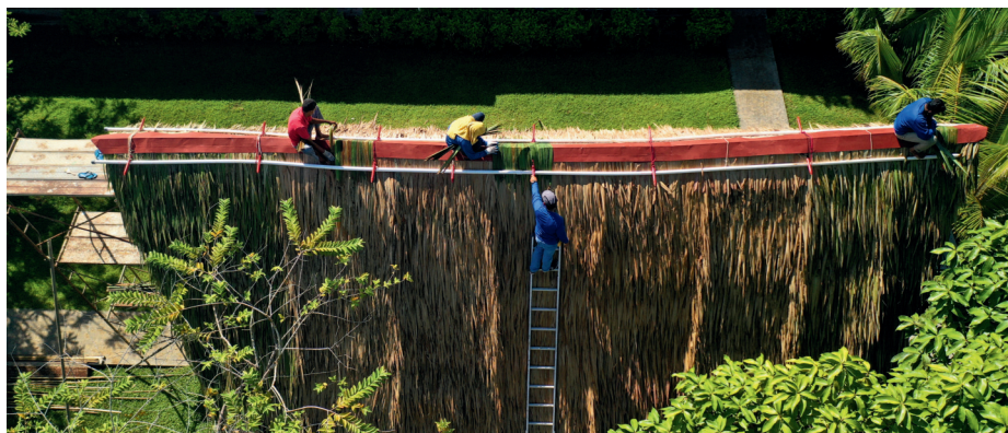
MESEKIU BAI: AERIAL VIEW SHOWING RENOVATION PROGRESS, NEARING COMPLETION

On December 19, 2025, the Mesekiu Bai began a new phase of renovation focused primarily on restoring the thatch roof and retouching the paintings of Palauan stories and legends that adorn both the interior beams and the exterior gables.