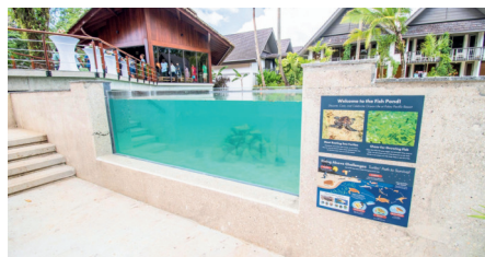
FISH POND @ LUUK NATURE CENTER

The Grand Opening of the Luuk Nature Center marks an exciting milestone in Palau's journey towards sustainable tourism and conservation education. As the center opens its doors, guests and, in the near future, students may be able to visit the center for educational purposes at no charge.