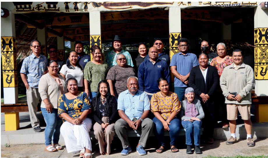
EXECUTIVE COMMITTEE GROUP PHOTO