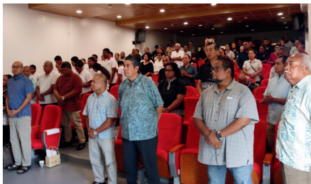
ATTENDEES PHOTOGRAPHED AT THE NATIONAL DAY OF PRAYER EVENT