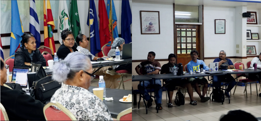
ACCREDITATION STEERING COMMITTEE (ASC) MEETING

Palau Community College (PCC) is proud to announce the ongoing efforts of our Accreditation Steering Committee (ASC), dedicated to ensuring the College remains accredited and continues to strengthen its educational offerings. Since becoming an accredited institution by the ACCJC-WASC in 1977, PCC has undergone multiple accreditation cycles. The College experienced five-year cycles in 1982, 1987, 1992, and 1997, followed by six-year cycles in 2003, 2010, and 2016. After the 2016 Self-Evaluation Report, Site Visit, and Focused Report, our accreditation status was reaffirmed for a new seven-year cycle. Most recently, in 2023, PCC underwent a comprehensive review, and our accreditation status was reaffirmed once again for another seven-year cycle. With a total of 47 years of continuous accreditation, our next comprehensive review is scheduled for 2030. Accreditation is needed for validating the quality of education at PCC, ensuring that degrees are recognized by employers, credits are transferrable to other institutions, and enabling access to Title IV (federal financial aid). It serves as a seal of approval, confirming that the institution meets high academic and operational standards.