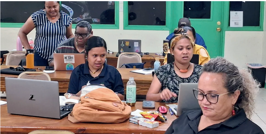
PACMED SECOND COHORT STUDENTS PICTURED DURING CLASS

The PACMED program is officially expanding its legacy with the arrival of its second cohort, welcoming 18 ambitious students attaining their Masters Degree in Curriculum Studies. This new group stands out for its remarkable diversity, drawing professionals from a broad mix of backgrounds to create a rich, multidisciplinary learning environment. In a unique bridge between classes, this year's students will benefit from the direct mentorship of two Teaching Assistants from the first cohort that graduated in May of 2025. Their firsthand experience will be invaluable as the new cohort navigates the rigorous 30-credit hour curriculum. With a journey ahead focused on advanced expertise and professional growth,