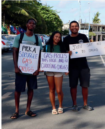
PCC STUDENTS HOLD ANTI-DRUG SIGNS AT THE PCC PARKING LOT

On Friday, March 27, 2026, Palau Community College (PCC) joined hands with the Palau Behavioral Health Advisory Council (PBHAC) to show strong support for the national Red Ribbon Campaign. At 4:00 PM, students, staff, and community members gathered in front of the PCC parking lot and across at Midtown Mobile Gas Station, proudly holding signs that carried the message: “Say No to Drugs.”