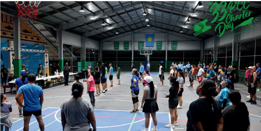
PARTICIPANTS OF THE 33 RD CHARTER DAY WALK AND RUN GATHER IN MESEKIU GYM

Last week, PCC celebrated its 33rd Charter Day with a special "President's Run & Walk" event. Participants gathered at the PCC Mezekiu Gym for registration before setting off on a course that passed the Belau National Hospital and concluded back at the gym. Approximately 200 individuals joined in, and those who completed the course received a free PCC t-shirt while supplies lasted. Additionally, all participants enjoyed a continental breakfast provided by the PCC Cafeteria.