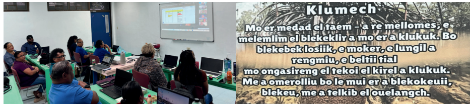
PACMED 2ND COHORT STUDENTS IN ACTION DURING A GROUP PRESENTATION

The Pacific Masters in Education (PACMED) Program continues to emphasize the importance of place-based learning by utilizing local environments, culture, traditional knowledge, and lived experiences as valuable resources in education. Grounded in the guiding principles of the 6 R's—Respect, Relationship, Relevance, Reciprocity, Responsibility, and Representation—the program embodies these values in every session.