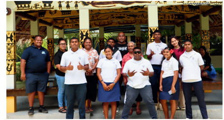
BMS STUDENTS AND STAFF PICTURED WITH PCC STAFF