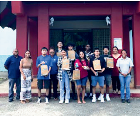
PCC IT STUDENTS AT PNCC AIRAI