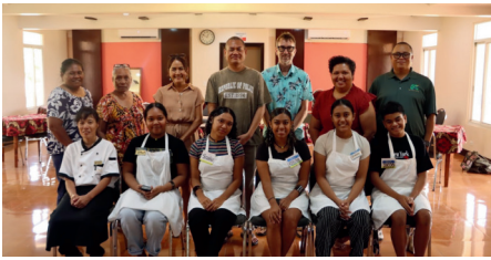
TH118 STUDENTS, PCC STAFF, AND COMMUNITY MEMBERS