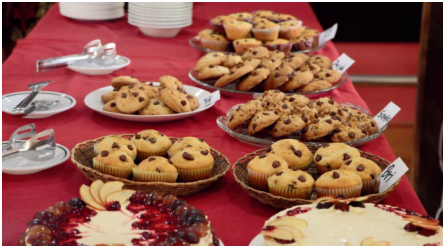
BAKED GOODS MADE BY THE TH118 STUDENTS

On April 27, 2026, the Palau Community College (PCC) Tourism & Hospitality School of Excellence conducted the final examination for the TH118 Baking course. This class equips students with the skills needed to excel in the pastry departments of hotels and restaurants, covering the art of preparing bread, pastries, and exquisite desserts. The exam was led by Instructor Yoko Morisaki, who invited PCC staff and community members to sample the students' creations and provide valuable feedback.