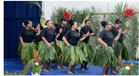
DANCERS FROM PCC PERFORMING AT PCC FUN NIGHT

ARTICLE WRITTEN BY: LEIS-TE'ANDRA ILEK, FRESHMEN REP TO ASPCC