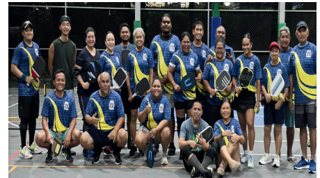
SPRING 2026 PICKLEBALL INTRAMURAL TOURNAMENT PLAYERS

The courts at Palau Community College (PCC) were buzzing with energy this season as the Spring 2026 Pickleball Intramural Tournament officially drew to a close. Organized by the PCC Recreation Office in partnership with Palau Pickleball, the event was a vibrant display of athleticism, strategy, and campus spirit.