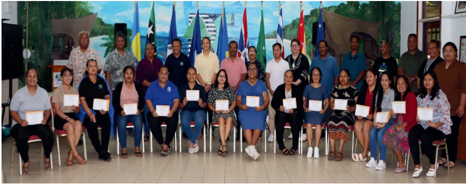
MAY 01, 2026: PCC FACULTY, GOVERNMENT OFFICIALS AND GRADUATES OF THE SECOND QUICKBOOKS TRAINING MODULE COHORT