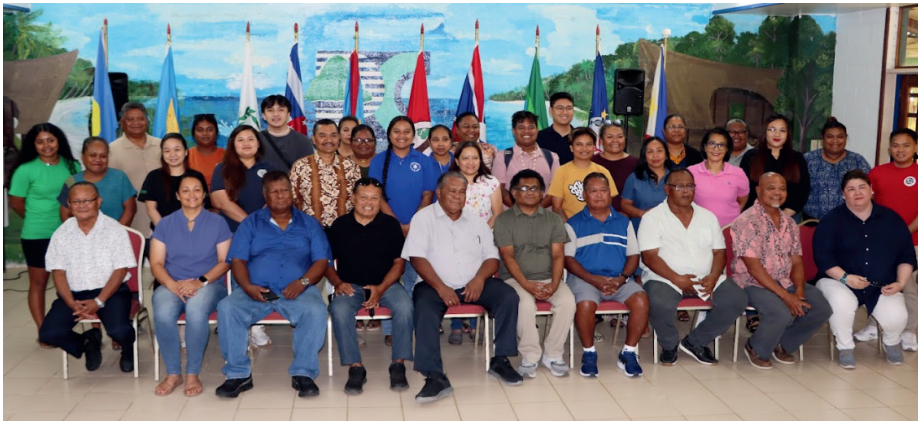
APRIL 17, 2026: PCC FACULTY, GOVERNMENT OFFICIALS AND GRADUATES OF THE FIRST QUICKBOOKS TRAINING MODULE COHORT

On April 17 and May 1, 2026, Palau Community College (PCC) proudly celebrated the graduation of participants who completed "QuickBook Training Modules," a comprehensive 20-hour training program designed to standardize financial reporting across Palau. This initiative is essential for enhancing fiscal management and ensuring audit readiness among state governments.