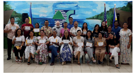
ATTENDEES AND RECIPIENTS OF THE CAREGIVER TRAINING PICTURED @ PCC ASSEMBLY HALL FOR AWARDING

On April 29, 2026, Palau Community College (PCC) proudly hosted a ceremony to honor the graduates of the 41st Caregiver Training Cycle. This event recognized the dedication and commitment of individuals who successfully completed the rigorous 20-hour course, aimed at addressing the growing need for skilled caregivers in our community.