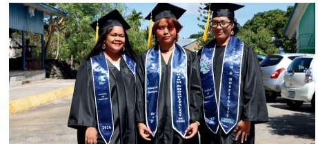
TOURISM AND HOSP. - HOSPITALITY MANAGEMENT TOURISM AND HOSP. - HOTEL OPERATIONS TOURISM AND HOSP. - TOUR SERVICES