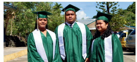
ADULT HIGH SCHOOL