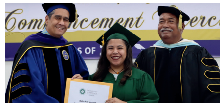
UNIVERSITY OF HAWAII AT MANOA