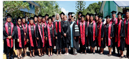
SAN DIEGO STATE UNIVERSITY