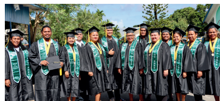
EDUCATION - EARLY CHILDHOOD + EDUCATION - ELEMENTARY EDUCATION