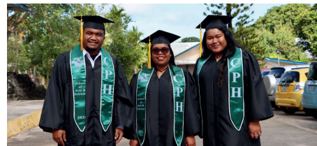
COMMUNITY AND PUBLIC HEALTH