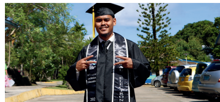
GENERAL ELECTRONICS TECHNOLOGY