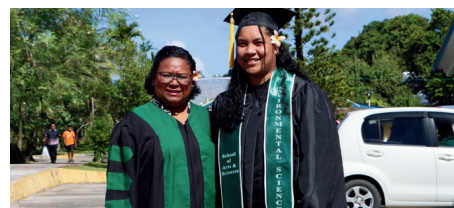
ENVIRONMENTAL / MARINE SCIENCE