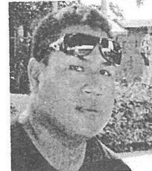
Ignacio Ngiraiwet Ngardmau State Government