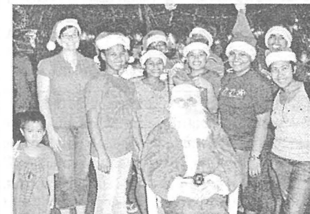
PCC Santa Claus & helpers at Bethlehem