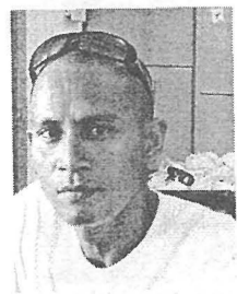
Trurang Tellei Rangers Koror State Government