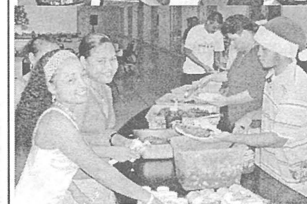
Dormitory students get together for a Christmas dinner