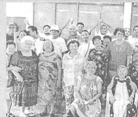
Marshallese students at the Old Age Center

Hooray for the Marshallese students! With a liveliness that stirred up the senses to stop and listen, the Marshallese students did "office-hopping" and sang Christmas songs around the campus. They also made a few stops off-campus by request. It is hard to imagine that a single finger of the conductor can elicit such melodies from the singers. Unencumbered by shyness, the students gave their hearts in their songs in this holiday season.