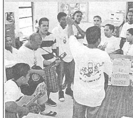
Marshallese students at PCC Development Office