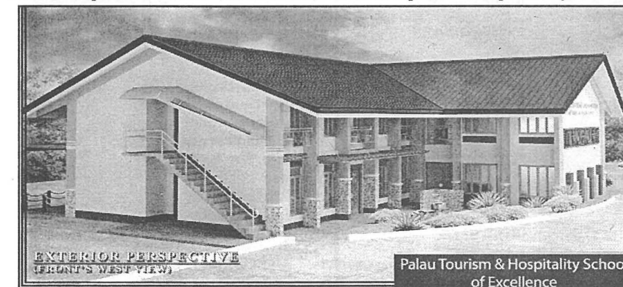
EXTERIOR PERSPECTIVE (FRONT'S WEST VIEW)