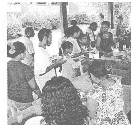
Christmas luncheon for PCC community