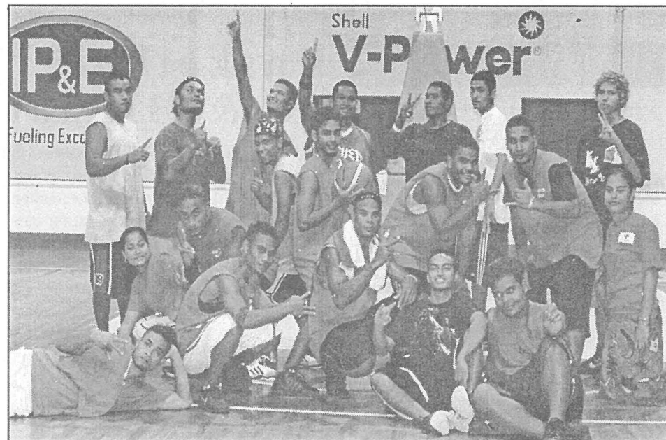
Outer Kids I with Meda team members in a photo op.