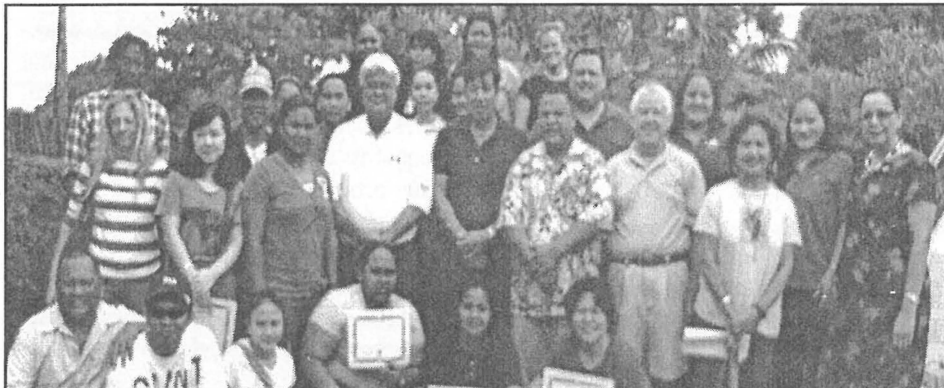
Day 2 trainees and sponsors after the training and receiving their certificates.