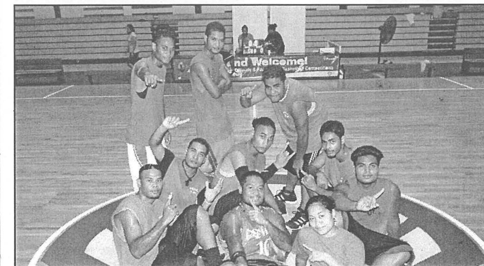
Team Outer Kids I after their winning game.