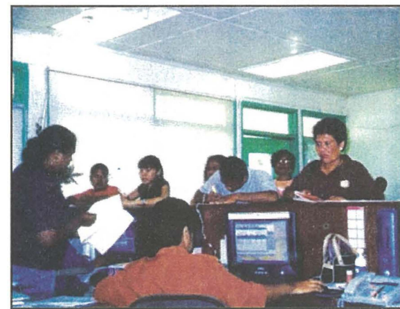
PCC Students Getting Ready for Spring Semester by Registering at the Registers Office