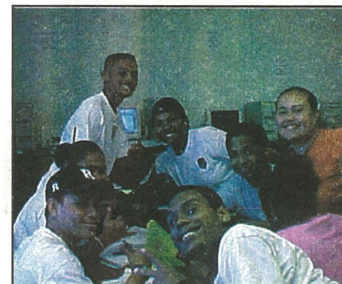
PCC students take a break from the Study Marathon to pose picture

On March 3 and 4, Project Beacon held a "study marathon" for students who wished to study for their midterms. Over 100 students showed up throughout both days and used the opportunity to study either on their own or with the help of the tutors and counselors or just got on the computers and did research or wrote their papers, essays, reports and assignments. Food and drinks were available for everyone while they studied.