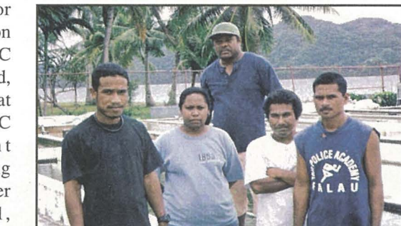
New members of the PCC Endowment Contributors' Club from the Ministry of Resources & Development's Bur. of Marine Resources

To donate or for more information about the PCC Endowment Fund, contact anyone at the PCC Development Office by calling telephone number (680) 488-2471, extension 253.