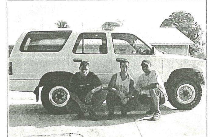
PCC Auto Mechanic students pose with one of the three police vehicles they painted at the PCC Automechanics Shop.