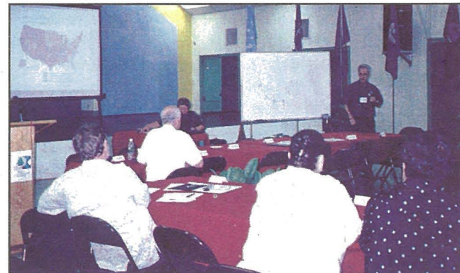
Participants at the Western Pacific Regional GPS, GIS, Cadastral Survey Conference listen attentively during of its lectures