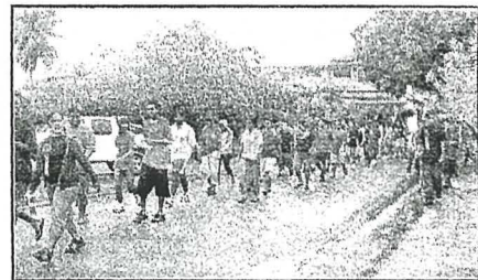
Visiting students with their tour guides heading down to the vocational/technical shops to begin their tour.