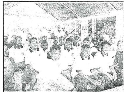
Students from Emmaus High School getting ready for their campus tour.