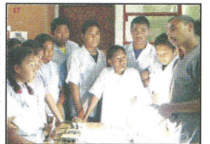
K.E.S. students learning the basics of electrical wiring from a PCC student.