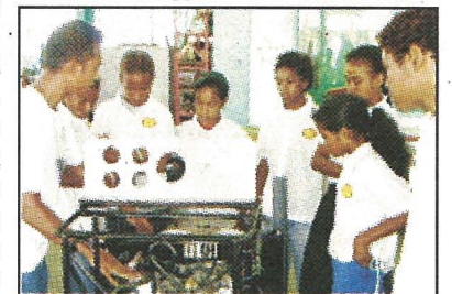
PCC student making a presentation on auto mechanic technology.