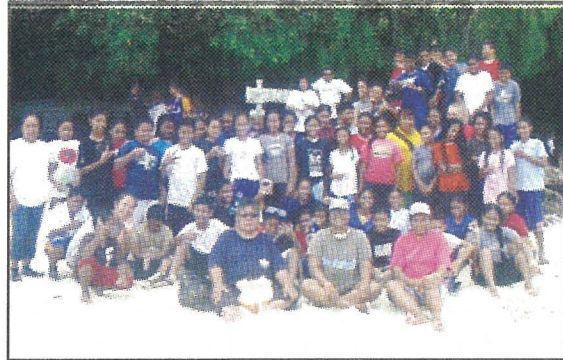
K.E.S. students, teachers and Talent Search staff pose for photo at the beautiful Rock Islands.