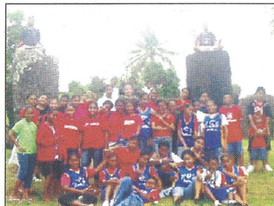
K.E.S. students pose at Ngarchelong's famous Baderulchau ruins.