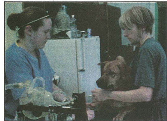
RAV Veterinarians conducting surgical procedures.

Spay and neuter surgeries at the PCC Science lab were performed by doctors from RAVS, the Rural Area Veterinarian Services, who have been providing such services in Palau for the past five years. Neutering is a safe and simple operation that surgically removes the reproductive organs of cats and dogs. Neuter surgery on female animals is sometimes called "spaying." These types of surgeries prevent females from becoming pregnant and prevent males from impregnating females.