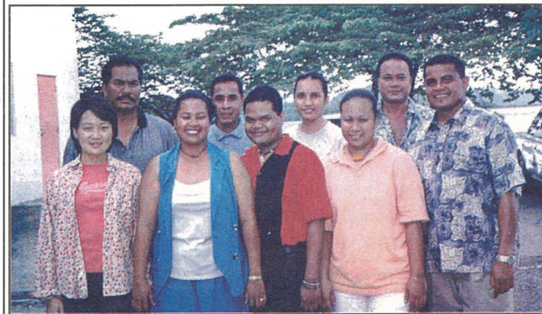
Employees of the Ministry of Commerce and Trade have just enrolled in the Endowment Contributors' Club