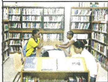
PCC and local high school students enjoying the library facilities.

The library serves as a community resource, open to everyone in Palau. With this in mind, the library staff has made every effort to meet our patrons' needs with regard to their research or reading enjoyment. We encourage every patron to make use of the