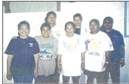
MOE employees from Ngchesar and Melekeok Elem. Schools are new members of the Endowment Club!