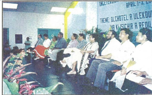
Honored Guests at the Opening Ceremony of the 10th Mechesil Belau Conference