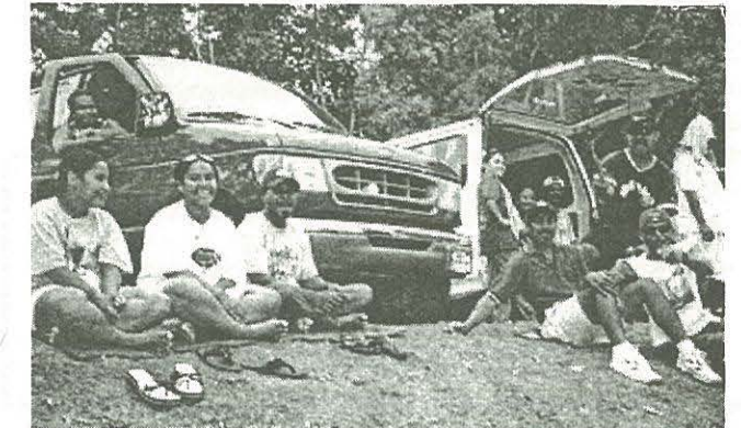
Fans came in droves and were apparently having a good time.