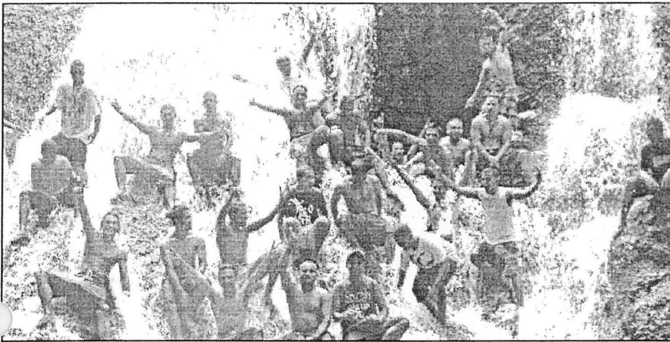
The dorm boys, while having a splashing time at Ngatpang Waterfall, pose for a photo op.

The male dorm residents were excited as they departed for their retreat held on March 12-13 at Cooperative Research Extension (CRE) campus in Ngermeskang, Ngarem-lengni. With the theme "My Role in Preserving Our Islands' Natural Habitat", the 73 students were not sure what was in store