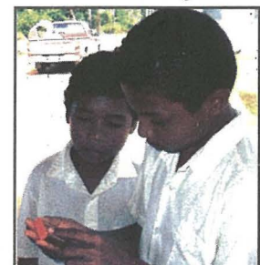
Ibobang Elementary students testing soil samples.