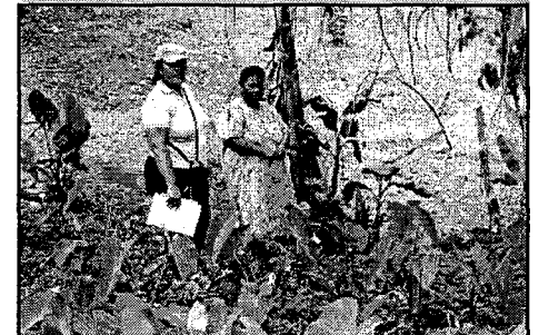
Tuioti visiting a farm in Aimeliik.

Since 2006, the Center for Pacific Crops and Trees (CePaCT) of the Secretariat of the Pacific Community (SPC) has been distributing to several Pacific Island Countries (PICs) the different varieties of disease resistant and drought tolerant taro, sweet potato and yam from their Climate