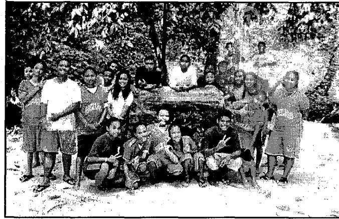
PCC archaeology students with BAC Staff at Metuker er a Bisech.

Ulong, along the western side of the island. Many of them wondered what the intentions of Orachel were when he painted the walls of many islands on his way to Koror.