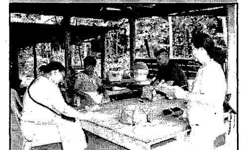
CE-AHS Staff survey Kayangel's educational and training needs. SPC Rep Cont'd p. 3