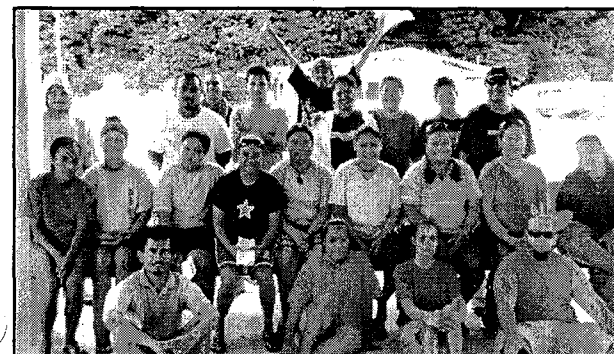
Peleliu AHS students.