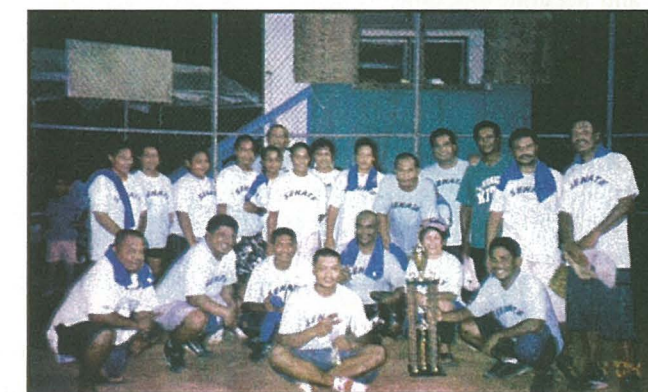
Tournament Winners: OEK's Soft Ball Team Pose for a Group Picture