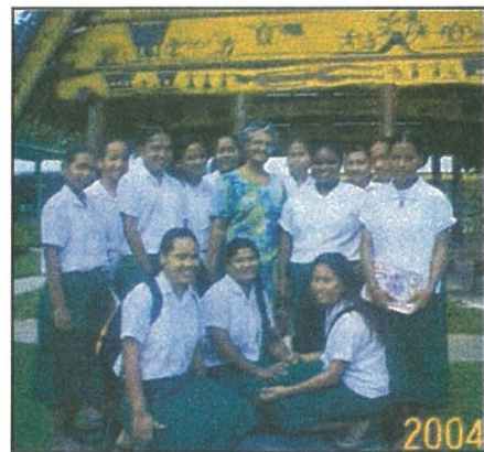
Bethania Students Tour Library

• Finally, to MOC/PCC Alumni Association, PCC Criminal Justice Students, PHS and Mokedau.com for setting up booths providing great food and refreshing drinks