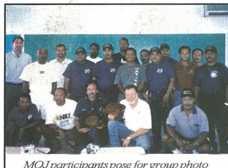
MOJ participants pose for group photo

A seminar on Fire Fighting and Emergency Management was conducted for public safety officials to enhance their emergency preparation skills. The US Forestry Service conducted the training at the Palau Community College from April 5-9, 2004. During the seminar, participants were taught how to effectively manage the effects of typhoons, landslides and other natural disasters. The participants included a delegation from Yap State of the FSM.