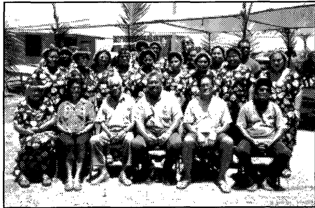
PCC-CRE EFNEP graduates from Ngarchelong state.

On April 12, PCC-CRE awarded certificates of achievement to 15 women from Ngarchelong State for having successfully finished the Expanded Food and Nutrition Education Program (EFNEP). The EFNEP is one of PCC-CRE's extension programs that trains interested community members on the preparation of nutritious foods and a well balanced meal, it also trains participants in the proper food handling and preparation methods to avoid things such as food poisoning and spoilage.