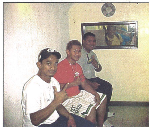
PCC Project Beacon students relax in the Court Marshals Office.