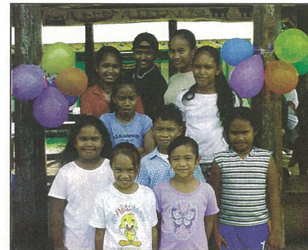
Happy children pose during a story telling session during PCC's Library Week.

The PCC Library concluded its Library Week event with a bang as PCC students, children and adults of all ages took part in weeklong activities aimed at promoting public awareness on one of Palau's most extensive libraries. The theme for Library Week 2005 is "Something for Everyone @ PCC Library." This year's celebration, from April 18-22 hosted a series of special activities such as an Open House, Movie Night, Kid's Story Time and conducted an introductory course on the Internet for Adult Learners.