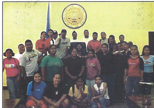
PCC Project Beacon students pose in the court room.