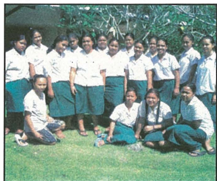
Bethania HS Participants

completion of the program, each participant received a certificate of completion.