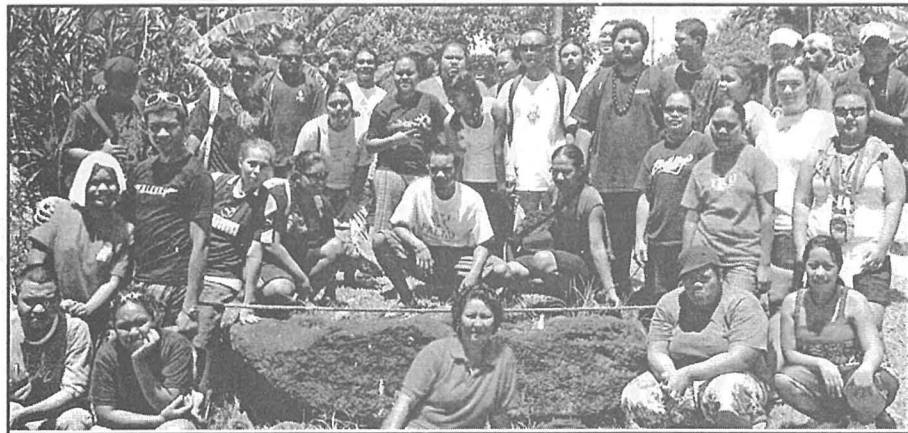
SSS participants at Orsachel er a Dub.

Submitted by: Student Support Services Students & Staff