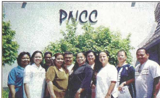
PNCC employees who have joined the Endowment Contributors' Club