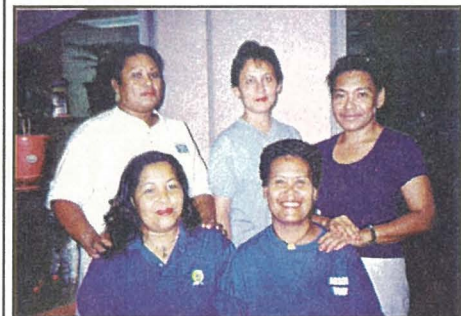
More PNCC staff join Endowment Club