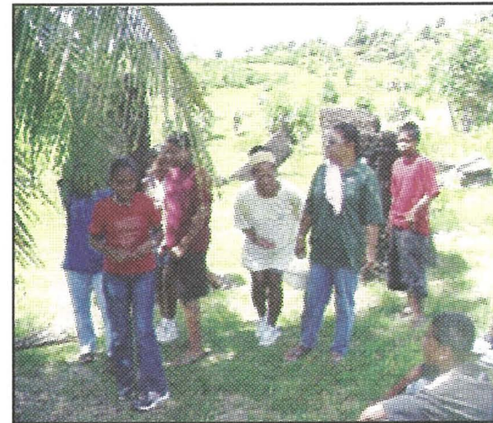
Meyuns Elementary School teachers and students at Badrulchau

On April 26, 2006, Talent search Participants from Meyuns Elementary went on a field trip to Badrulchau Stone Monoliths site as a part of their classroom instructions. There were 50 students along with 5 teachers and 3 parent volunteers who chaperoned the trip.