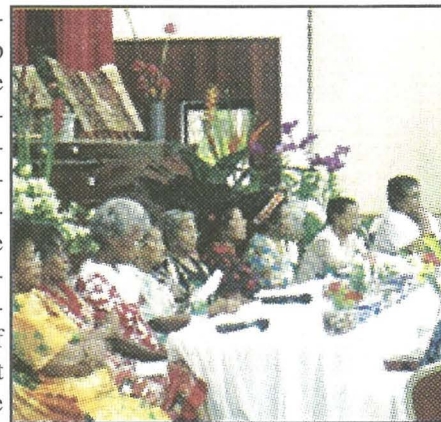
Women panelists at the 13th Mechesil Belau Conference