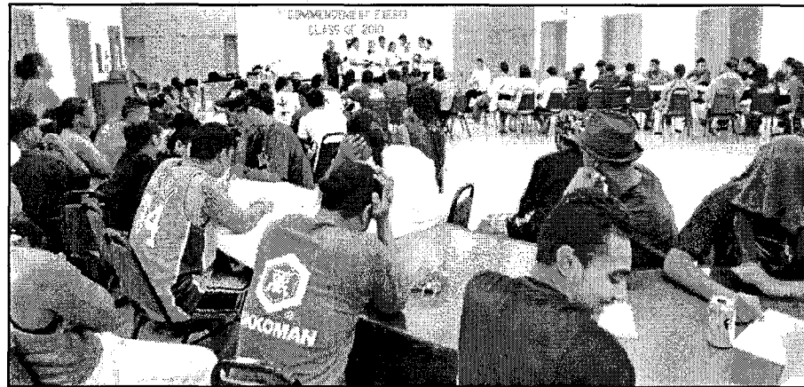
Dorm students & SDA Youth Ministry singing.