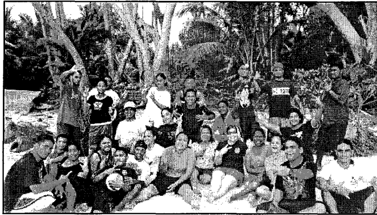
LS students at Diche's Beach Resort, Ngaraard State.

Last weekend, the Library & Information Services (LS) students went on a retreat to Diche's Beach Resort in Ngaraard. The focus of the retreat was to build a bond between all of the LS students in an effort to encourage success in the program and to give the students an opportunity to relax and enjoy before beginning the stressful final weeks of classes.