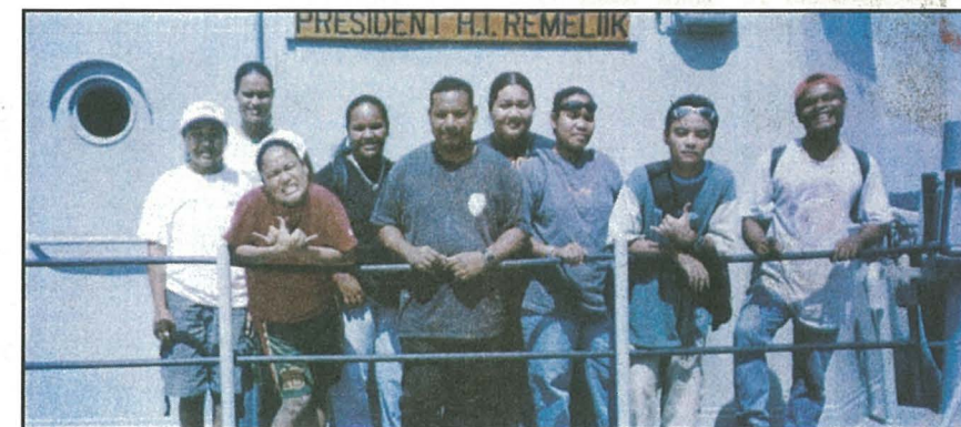
CJ Students Pose on the Patrol Boat