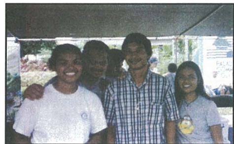
PCC Environmental Club

One of the most active PCC student organizations, the PCC Environmental Club, continued its active ways, participating in the observation of Earth Day on April 22nd, held this past week. The Club booth had signs, posters and demonstrations on effective waste management practices.