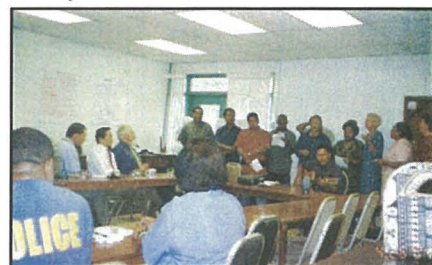
Fellowship Participants Sing Praise