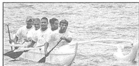
Men's team coast in after winning the 500 meter sprints by more than two canoe lengths.

1 st place in both the 500 meter and 1500 meter races. PCC Voyagers came in 5 th in the men's 500 meter race and 4 th in the 1500 meter race, and PCC Achocho took 5 th place in both the women's 500 meter and 1500 meter races. After the long day of competition, the entire paddling team went to Drop Off to celebrate the victory. Congratulations PCC Paddlers!