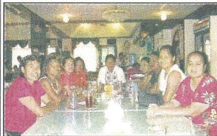
Secretaries enjoy a luncheon sponsored by PCC at a popular "all-you-can-eat" restaurant.

On April 28th the Palau Community College celebrated Secretaries' Day with the college's secretaries by sponsoring a special luncheon on their behalf. The luncheon took place at one of the well-known "all-you-can-eat" eateries in town. This occasion is done every year in recognition of all the secretaries around the world. PCC thanks all secretaries for their hard work and support.