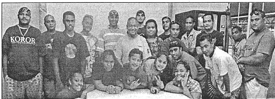
Students at Surangel Construction..

On Tuesday, May 1st 2012, 19 prospective spring and summer graduates who are majoring in Small Engine and Outboard Marine Technol-