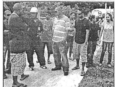
Students at PPUC site in Malakal.