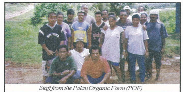
Staff from the Palau Organic Farm (POF)