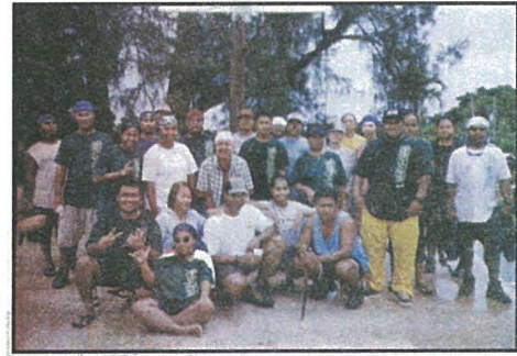
Volunteers Pose after Mikania Clean Up

Over forty people participated in the 4 th Annual Mikania Clean Up. This year's Mikania clean up focused on the PCC campus area. The goal of the event is to rid PCC campus of the (Mikania micrantha, Teb el Yas , or "Mile-a-Minute"). Despite the heavy rain PCC staff, students, volunteers and members of the Bureau Agriculture rummaged through the thick underbrush chopping, tripping and cutting down the Mikania plant.