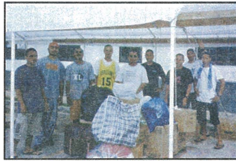
PCC Students Help with Yap Relief Drive