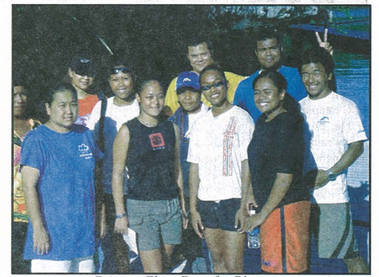
Science Class Pose for Photo