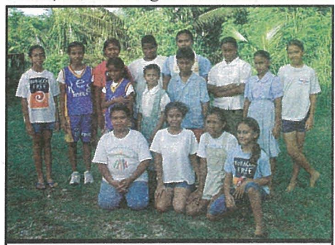
CRE Graduates Young Environmentalists