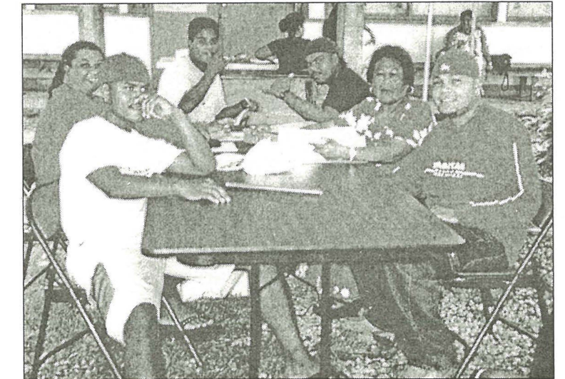
Tents were set up outside Admissions Office to expedite Registration