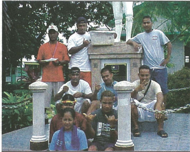
Students from the FSM Club Pose for a photo after enjoying a delicious lunch