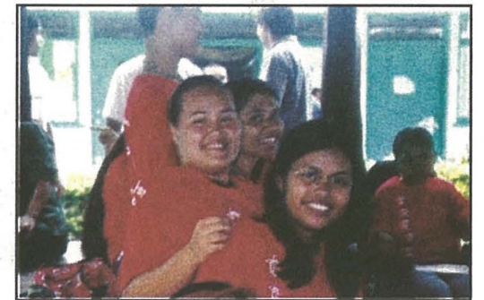
Members of PCC's Environmental Club having a Meeting at the Mesekiu Bai