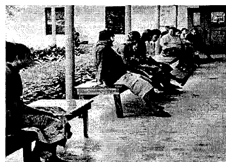
Waiting in line to pay registration fee.

PCC CAN HELP YOU UPGRADE YOUR SKILLS TO BOOST YOUR CAREER! COME TO PCC! Call 488-2470