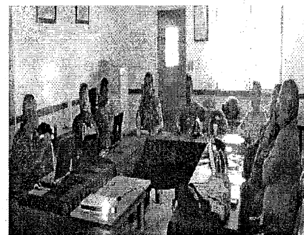
PACC Members meeting in Conference Room