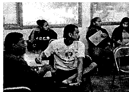
Students in Student Life waiting to see advisors.