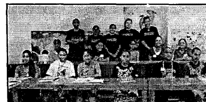
New Students with Continuing Student Tour guides