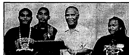
School of Technical Education students & Advisor