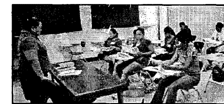
Students in College of Arts & Science with Advisor