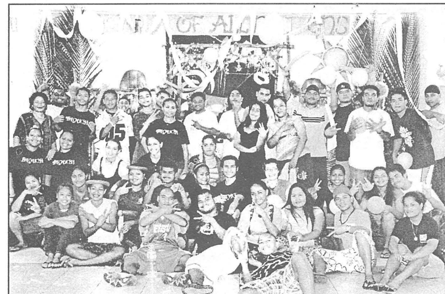
PCC students and their advisers at the Spring-Fling party last Saturday.

To give students a reprieve from the mentally taxing exercise of preparing for final class presentations and semester