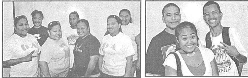
Office Administration students

By: Office Administration Program students