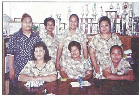
Airai Elementary School staff are the newest members of the Endowment Club!