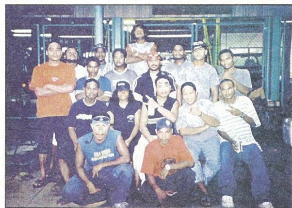
PCC's Automotive Mechanics Technology students pose for a photo during their end-of-semester barbeque held Friday May 9, 2003 at the PCC Automotive Mechanics Shop.