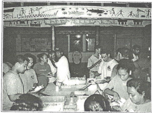
With exams out of the way, students feast and contemplate summer vacation plans.