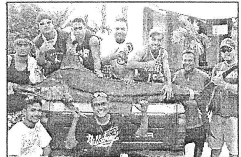
Dorm residents all smiles as they get ready to unload the fish.