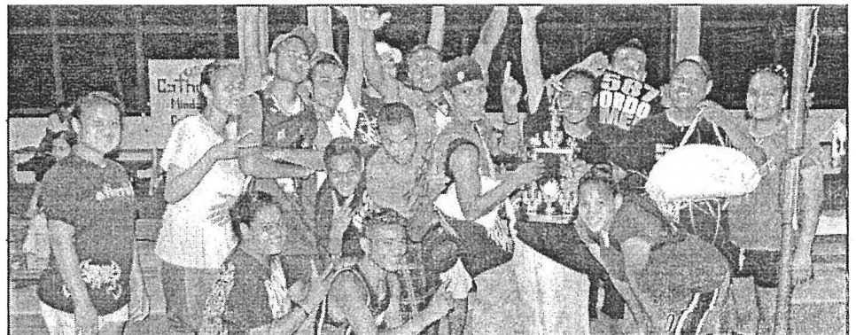
Team WoWpese with the 1st place trophy.