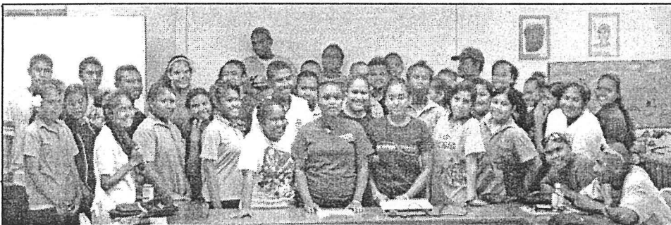
UBMS participants in group photo after their workshop.